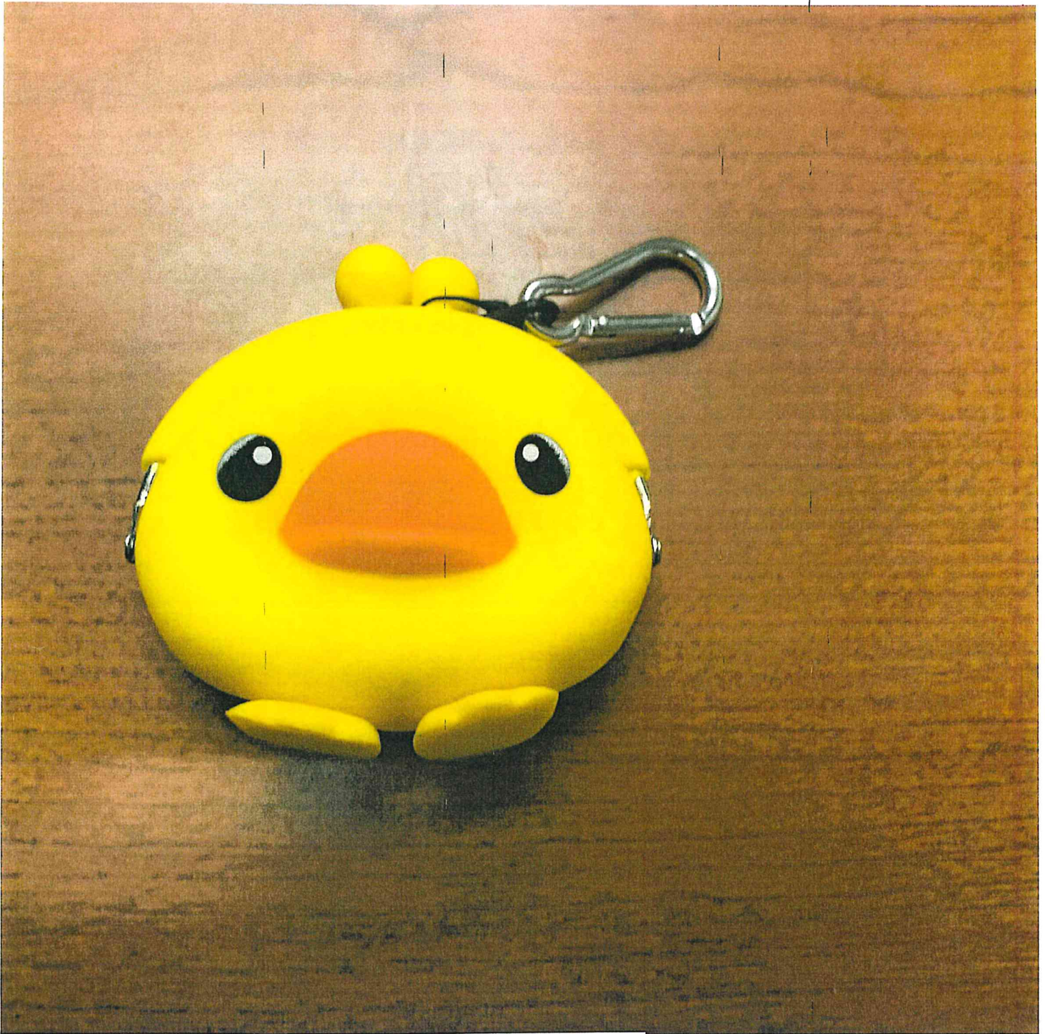
File No. 147-23 Addendum No. 2 Promo Items Re-Bid