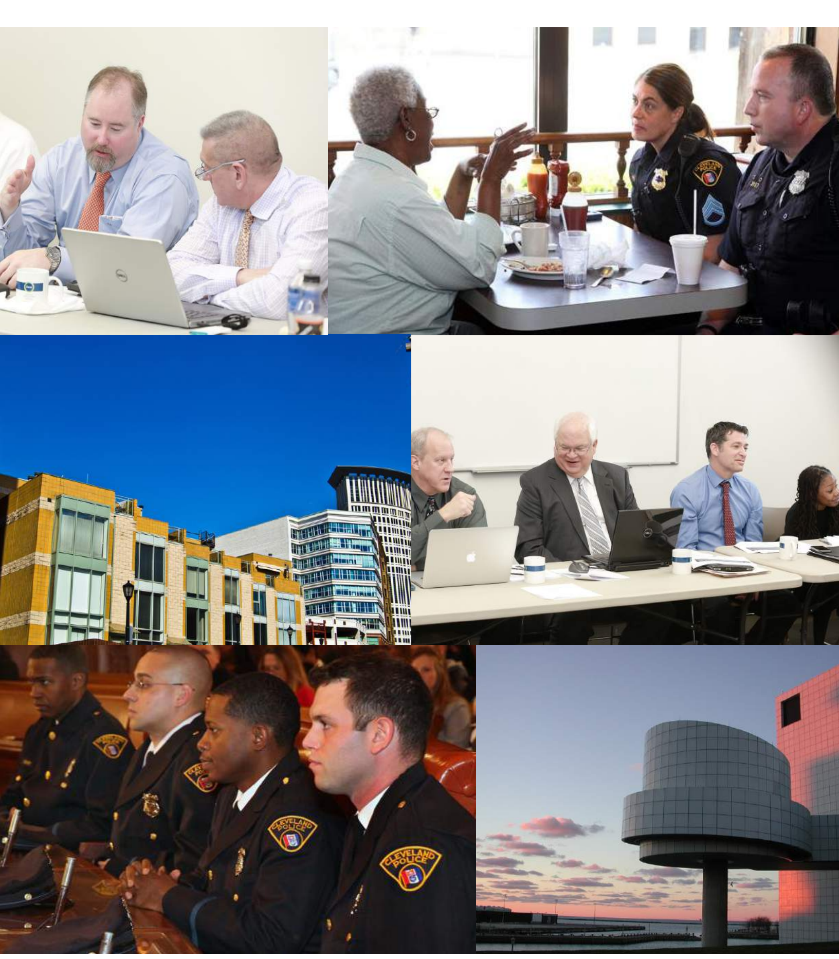
Report Photo Credits: CPD; City of Cleveland; Alvin Smith