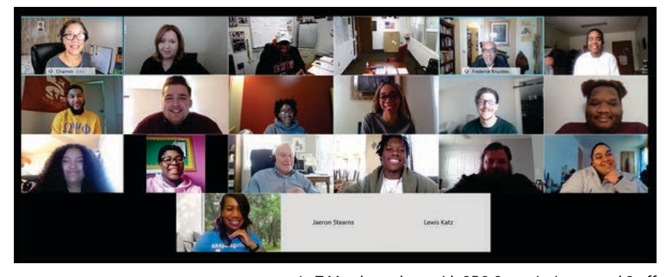
LoT Members along with CPC Commissioners and Staff on their first virtual meeting of 2021