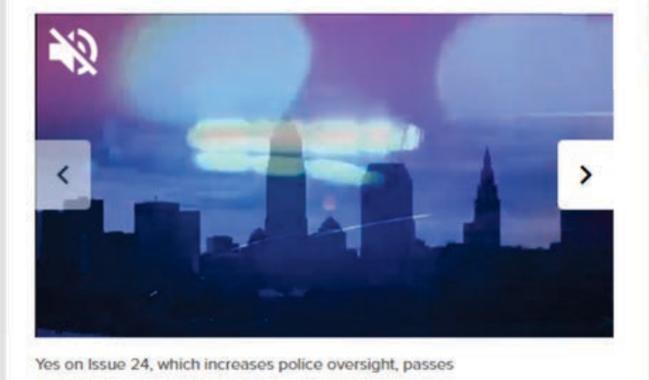
(News 5 Cleveland)