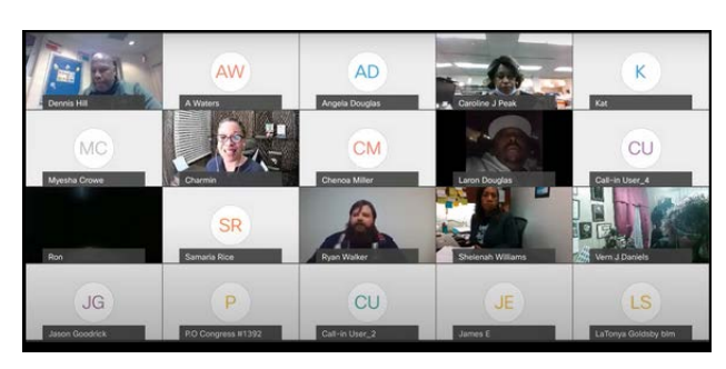
A screen shot from a virtual CPOP meeting on Nov 2021

The CDP's DPCs Strategy, which was designed to bring them into compliance with the mandates of the Consent Decree, was approved by the Court on