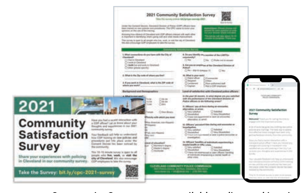
Community Surveys were available online and in print. Survey postcards were mailed to select zip codes.